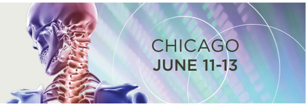
Exhibit Space Application & Sponsorship/Advertising Order Form